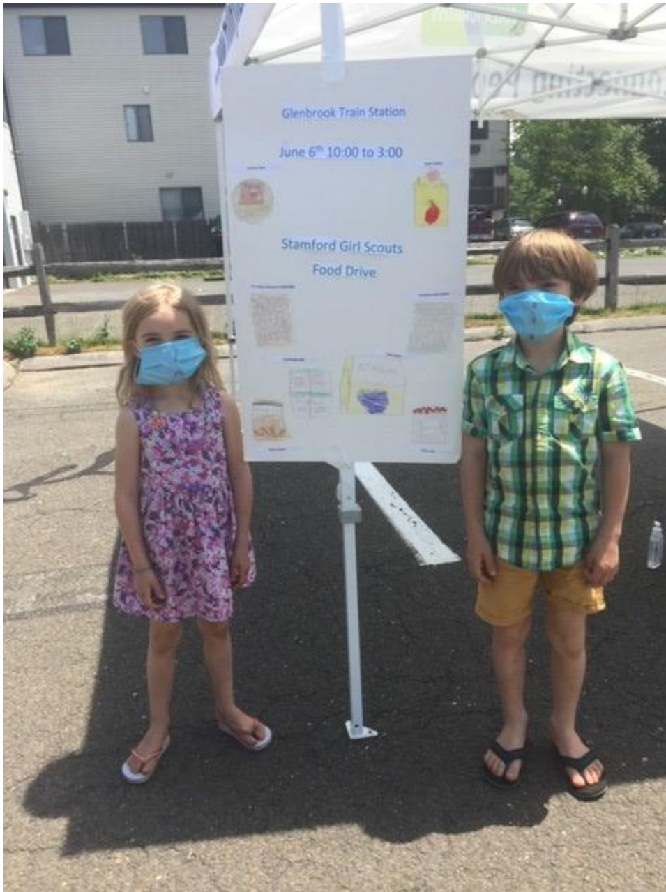
Children's Leadership Training Institute (CLTI) young leaders helped the Stamford Girl Scouts for a food drive benefiting The Food Bank of Lower Fairfield County.